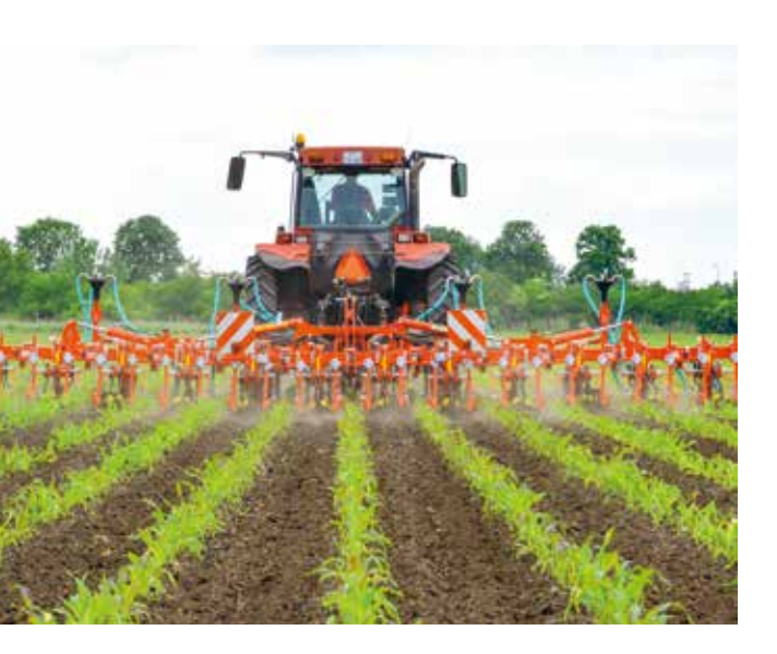
As a crop row, maize offers very favourable conditions for the use of mechanical weeding systems.

ment. The necessary level describes the application intensity of pesticides, which is needed to safeguard the economically viable cultivation of crops. It is assumed that all other practicable means for control and suppression of harmful organisms are exhausted. The intensity of the application of plant protection products can easily be shown by means of a treatment index. In comparison to other important arable crops, maize clearly has the lowest treatment index (see graph). As maize is fairly susceptible to competition with other plants and to pests in its juvenile stage, weed control as well as sustainable and responsible seed treatment is required, as one of the few indispensable crop protection measures.