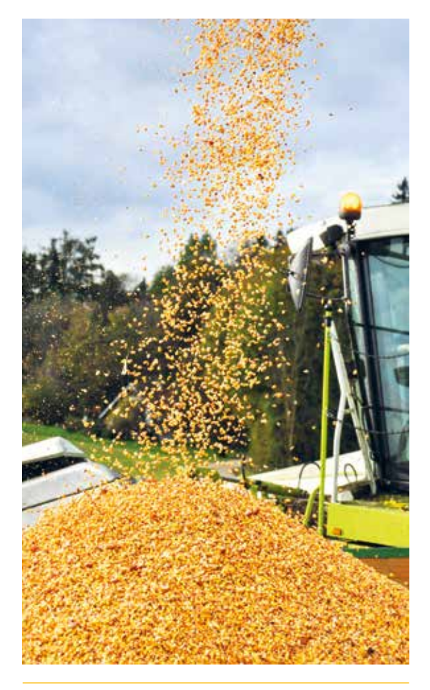
The yield of grain maize has risen steadily over the years.

The majority of the total amount of grain maize processed in Germany (production and import), is used for producing animal feed. With the quantity that remains on farms for feeding, this amounts to about 70 %. Almost 20 % is directly or indirectly used in the food sector via processed starch. Smaller quantities are utilised in the production of ethanol and in technical